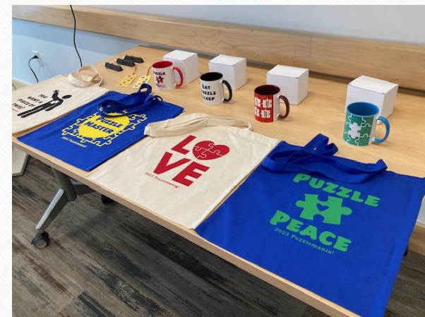
Prizes for Puzzlemania program