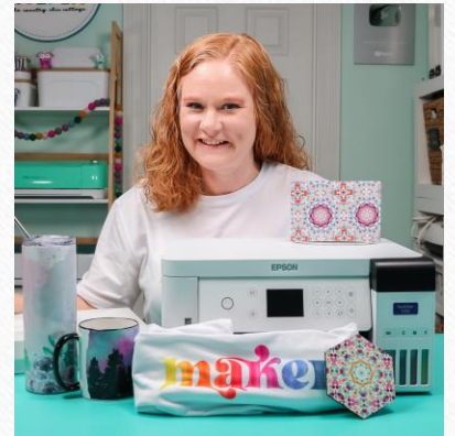
The Country Chic Cottage