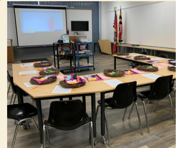
Room set up Without MS