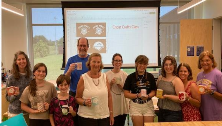
Infusible Ink Mugs