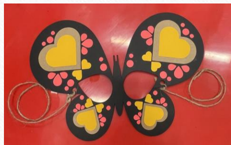
Take & Makes