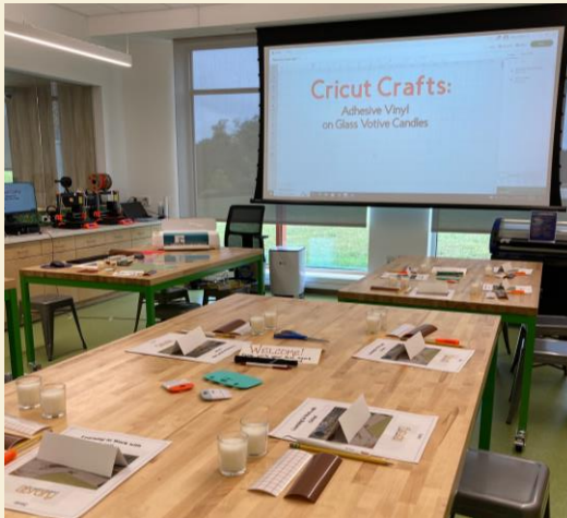
Room Set up With MS